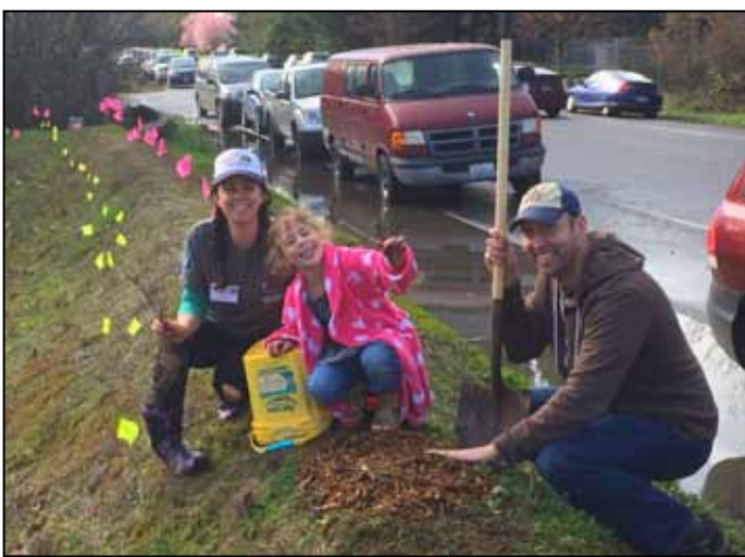
TCD pollinator garden

Be sure to see the photo on the mailing panel.